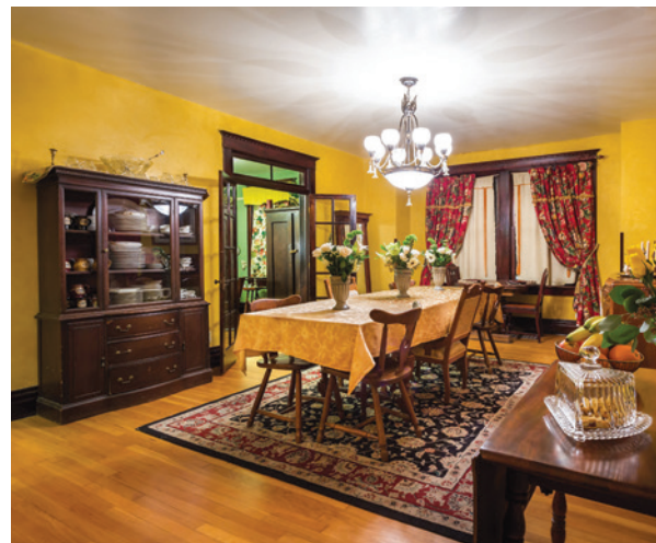
Top left, clockwise: Heritage House at dusk, photo courtesy of Downtown Historic B & B. Banana-stuffed french toast, huevos rancheros with lentils; Spy House dining room; and Spy House entryway. Page 41: The Rosenberg Room in the Spy House. Photos by Emily JoAnne Photography.